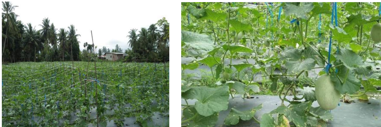
Figure 1. Condition of melon farmland in Lancang Barat Village, Dewantara Subdistrict, North Aceh.

melon crops is still not profitable for farmers because it still involves third parties or agents (middlemen), meaning that farmers do not have direct access to distributors, wholesalers and modern markets (M. Singh dkk., 2025). This has an impact on reducing farmers' income and turnover.