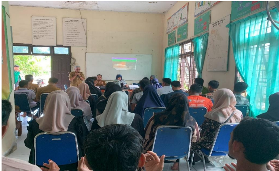
Figure 4. Training for the Geuthena Farmer Group on the Use of Marketplace Applications with GPS Track and Trace Features

The training session for the Geuthena Farmer Group marks a pivotal shift toward digital literacy and logistical autonomy within the local agricultural sector. By focusing on the integrated use of marketplace applications featuring GPS Track and Trace capabilities, this workshop equips millennial farmers with the technical proficiency to manage their own distribution channels. This hands-on training ensures that participants can move beyond theoretical knowledge to practical application, enabling them to monitor real-time shipments and optimize delivery routes for their harvests. As a result, this capacity-building initiative serves as the primary engine for reducing reliance on middlemen, thereby ensuring higher profit margins and the long-term sustainability of the Geuthena group's digital economic transition.