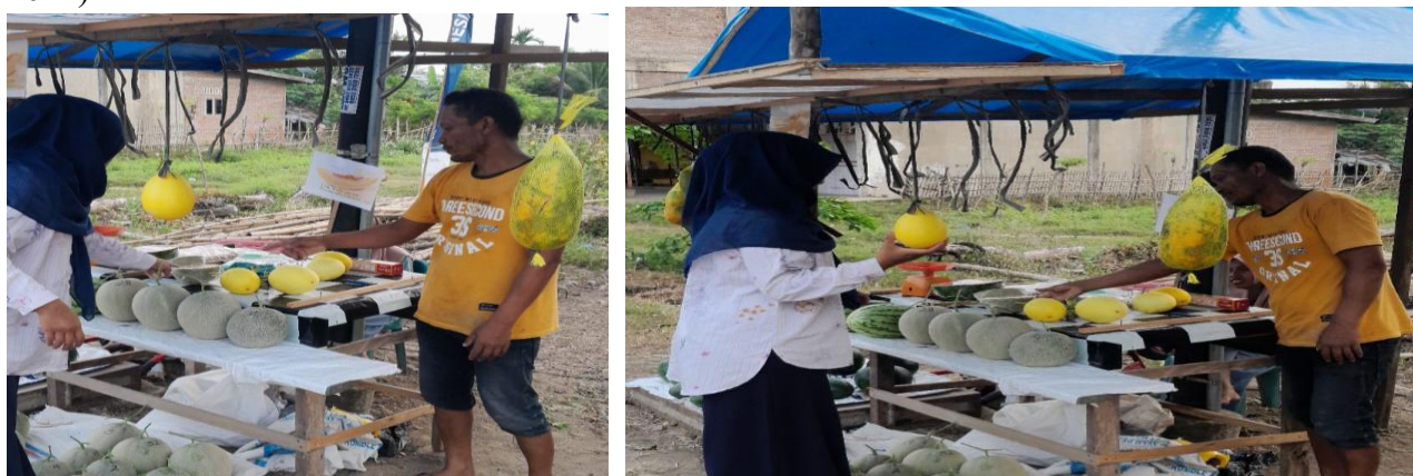
Figure 2. Melon sales in front of melon cultivation fields, still selling in the area around Lacang Barat Village, Dewantara District, North Aceh.

During the field survey conducted by the proposing team, melon production in Lancang Barat Village was around 8 tonnes per harvest, with a land area of 1,200 square metres and melon farmers having mastered melon cultivation techniques (N. Singh dkk., 2025). The North Aceh Government hopes that this large amount will serve as an example or pilot project for other villages to adopt the melon cultivation techniques used by melon farmers in Lancang Barat Village (Abou-Mehdi-Hassani dkk., 2025). In observations conducted by the team proposing the issues occurring in Lancang Barat Village, melon farmers must increase productivity and distribution channel efficiency (Ulva, Fadhliani, dkk., 2023). With many competitors (melon farmers from other villages), melon farmers in Lancang Barat Village must create branding and modern marketing strategies (Ulva, Yulisda, dkk., 2024).