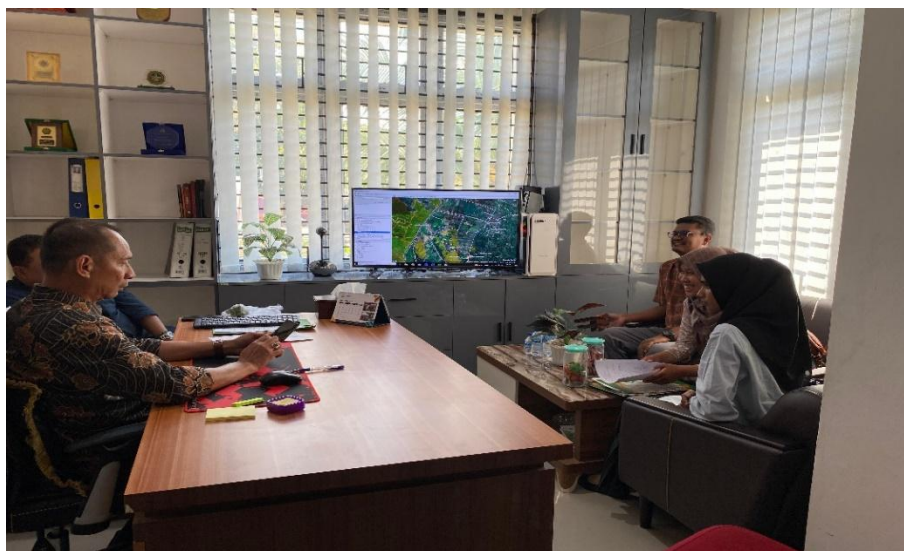
Figure 5. Data analysis and roadmap development with the North Aceh Agriculture Office

The training session for the Geuthena Farmer Group marks a pivotal shift toward digital literacy and logistical autonomy within the local agricultural sector. By focusing on the integrated use of marketplace applications featuring GPS Track and Trace capabilities, this workshop equips millennial farmers with the technical proficiency to manage their own distribution channels. This hands-on training ensures that participants can move beyond theoretical knowledge to practical application, enabling them to monitor real-time shipments and optimize delivery routes for their harvests. As a result, this capacity-building initiative serves as the primary engine for reducing reliance on middlemen, thereby ensuring higher profit margins and the long-term sustainability of the Geuthena group's digital economic transition.