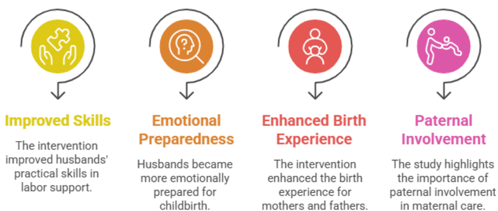
Figure 2. Intervention Impact