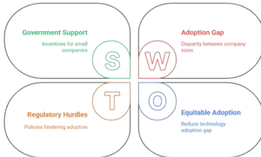
Figure 2. Blockchain Adoption in Food Sector

The case study conducted in the Murcia region provides a more in-depth picture of the implementation of wastewater treatment technology for irrigation. A farmer group in the region has been using treated wastewater for the past three years to irrigate tomato and melon fields. The data showed a 12% increase in crop yields in tomatoes and 10% in melons after the use of treated wastewater.