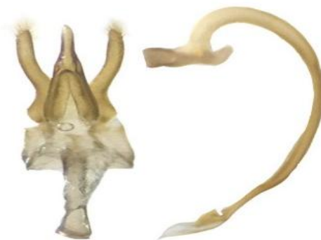
Figure 1. Male genitalia of A. bipunctata : a) siphon, b) tegmen.