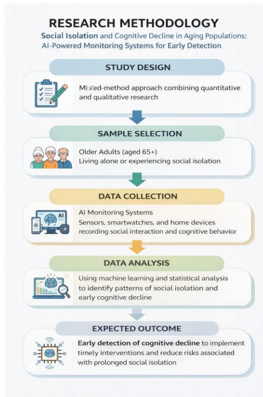
Figure 1. Illustrates a structured research methodology for the study titled

The image illustrates a structured research methodology for the study titled “ Social Isolation and Cognitive Decline in Aging Populations: AI-Powered Monitoring Systems for Early Detection. ” It visually presents the data collection phase as a key component of the research process, emphasizing the use of AI-powered monitoring systems such as sensors, smartwatches, and home-based digital devices. These technologies are designed to continuously track behavioral patterns, physical activity, and social interaction levels among elderly individuals. The integration of such tools enables real time data acquisition, allowing researchers to detect early signs of cognitive decline associated with social isolation. The infographic highlights how advanced technology supports non invasive and continuous monitoring, improving the accuracy and efficiency of data collection. Overall, the image conveys the importance of combining artificial intelligence with healthcare research to enhance early detection and intervention strategies in aging populations. The research involved the continuous, passive collection of in-home sensor data, which served as the primary predictor variables, and periodic, in-person neuropsychological assessments, which served as the ground truth outcome measure for cognitive status (Abd-Alrazaq, 2024; Shamta, 2024).