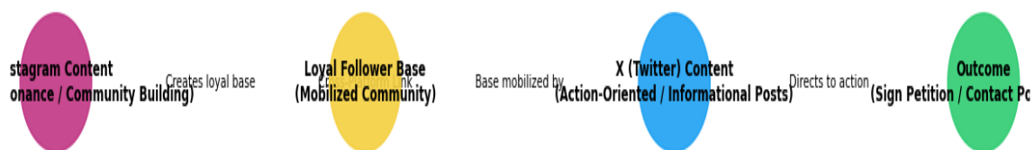
Figure 1. Integrated Cross-Platform Strategy: Instagram to X Action Funnel

The simplification of scientific information, particularly on platforms like TikTok and in the concise format of X, represents a strategic response to information overload and audience fatigue. This approach infers an understanding that for communication to be effective in a crowded digital landscape, it must be easily digestible and memorable. This “snackable” content strategy allows complex ideas to penetrate public consciousness and serves as a gateway for audiences to seek more detailed information, effectively lowering the barrier to entry for climate engagement.