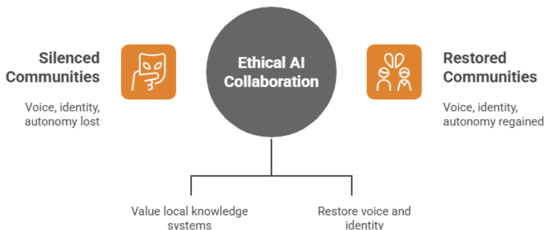
Figure 2. Ethical Co-creation for Digital Resurrection

The overall results indicate that AI-driven language revitalization is not merely a technological process but a socio-cultural and ethical negotiation. Projects that integrate community agency, cultural context, and data sovereignty achieve higher sustainability, legitimacy, and educational impact. The findings challenge the assumption that digital innovation inherently promotes inclusion, revealing that equitable governance structures are crucial for authentic revitalization.