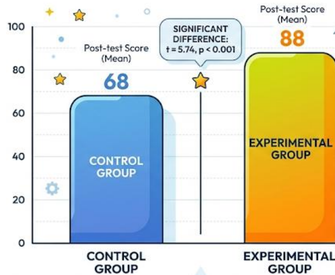
Figure 1. Efficacy of Emotional Intelligence Counseling

statistically significant ( t = 1.42 , p = 0.16 ), suggesting limited impact from standard classroom activities.