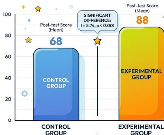
Figure 1. Efficacy of Emotional Intelligence Counseling

statistically significant ( t = 1.42, p = 0.16 ), suggesting limited impact from standard classroom activities.