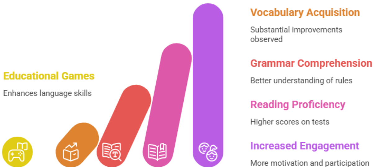
Figure 2. Educational Games Boost Indonesian Learning

game-based learning to transform traditional teaching methods. These results provide strong evidence for the integration of educational games into language curricula, offering a scalable and interactive approach to improving student outcomes in both cognitive and affective domains.