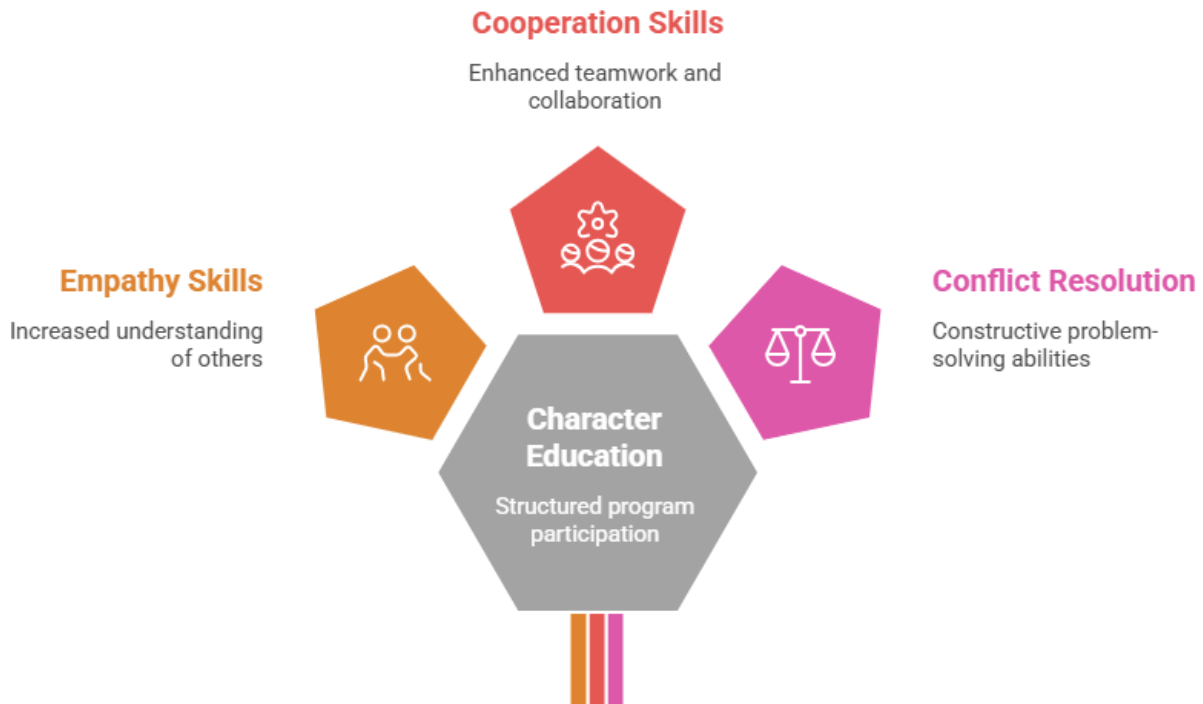
Figure 2. Character Education Improves Social Behavior

The results suggest that integrating character education into the curriculum can provide students with the skills and values necessary for constructive social interactions. These programs not only enhance individual behavior but also create a culture of mutual respect and inclusivity, benefiting the broader school community.