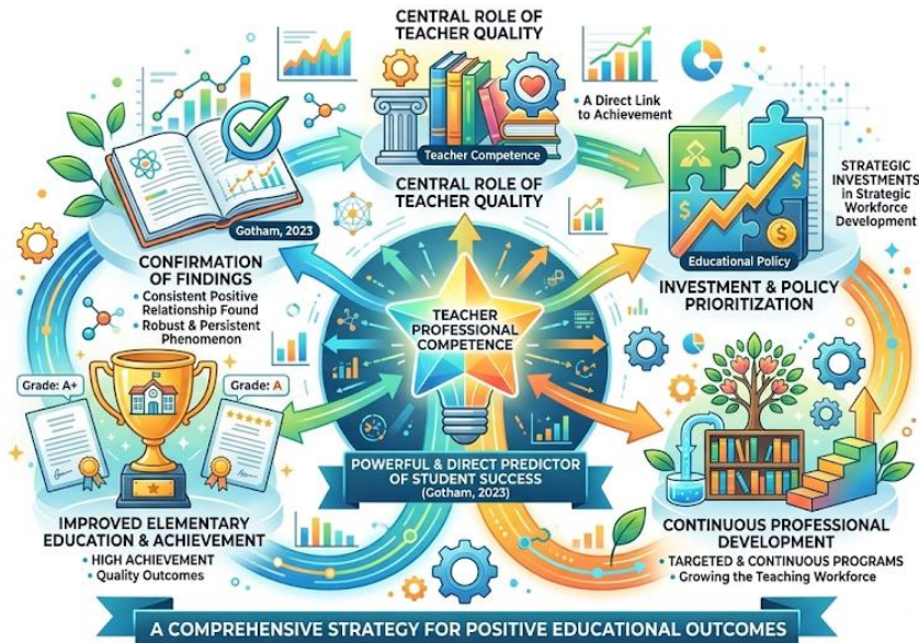
Figure 2. A Comprehensive Strategy for Positive

strong, and positive correlation between the professional competence of elementary school teachers and the achievement of Graduate Competency Standards by their students. This relationship was found to be consistent across different school types and was vividly illustrated by the large achievement gap between students taught by the most and least competent teachers.