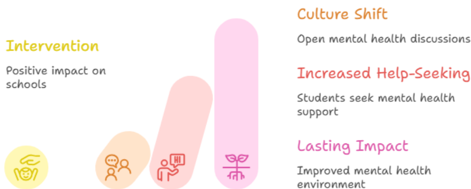
Figure 2. Intervention Improves School Mental Health

The study also highlights the broader societal implications of integrating mental health education into school curricula. By reducing stigma and increasing mental health literacy, such interventions contribute to creating a more supportive and empathetic environment for students. These findings resonate with the growing global focus on mental health awareness in schools and provide further evidence of the potential benefits of early mental health education in reducing stigma and promoting mental well-being.