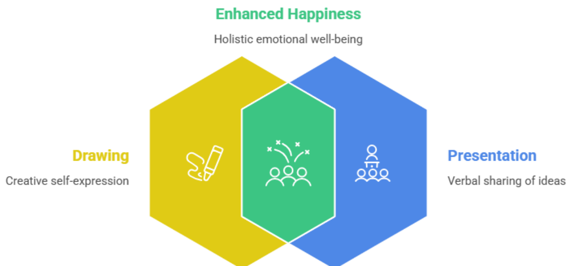
Figure 2. The Power of Integrated Creative Expression and Presentation

The novelty of this research lies in integrating drawing and presentation activities within a single intervention framework to enhance happiness among adolescents living in orphanages. While previous studies have focused on art therapy or emotional regulation independently, this study provides empirical evidence that combining creative expression with verbal presentation can produce significant emotional benefits. These findings have practical implications for orphanage caregivers, educators, and mental health practitioners in developing structured psychosocial programs aimed at improving adolescents' happiness and emotional well-being.