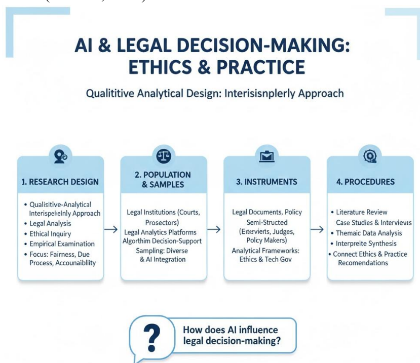
Figure 1. Research Flow

The research instruments included an Arabic language competency test and a questionnaire. The competency test was administered in the form of pre-test and post-test to measure improvements in speaking, listening, and vocabulary mastery. The questionnaire was designed to capture students' perceptions, motivation, and level of engagement during the learning process using audio-visual media (Röchert, 2022).