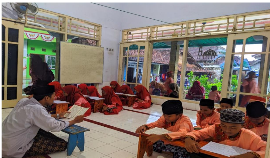
Figure 2. Application of the Bandongan Method using the Jurumiyah book

Through this research, it can be seen that the application of the bandongan method to students at the Jabal Nur madrasah diniyah using the Jurumiyah book provides a more critical and in-depth understanding as a good starting point for understanding the most basic tools as a strong foundation when applying the practice of reading classical Islamic texts such as the Safinatun Najah book so that the quality of reading and analyzing each phrase in the book is better and more in-depth, considering the strength of the tools of knowledge as a support for the quality of reading during sorogan and the critical thinking of the students when analyzing each phrase in the Safinatun Najah book so that every reading of the contents of the Safinatun Najah book moves from one fashal to another in a better and more correct manner. This is because in this method, the teacher maximally guides the students' ability to master the material. Meanwhile, the effectiveness of the bandongan method lies in the achievement of quantity and the closeness of the relationship between the santri and the kyai or ustadz (Arifin, 2013). In addition, the bandongan method allows santri to learn in a collaborative atmosphere.