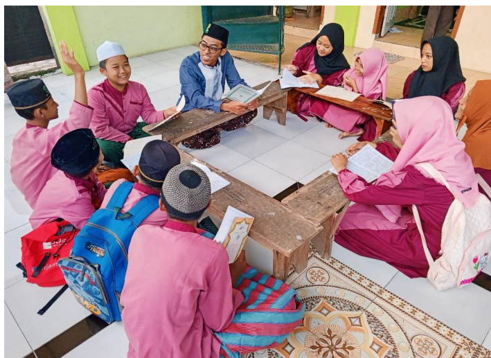
Figure 1. Application of the Bandongan Method Using the Jurumiyah Book

This study makes an important contribution to mapping ways to overcome the weaknesses of sorogan. Through observation and interviews, it was found that teachers at Madrasah Diniyah Jabal Nur apply complementary strategies by combining sorogan and bandongan. In bandongan sessions, teachers provide general explanations of i'rab structure, sentence context, and global meaning that were previously difficult for students to understand during sorogan. This strategy reduces the time burden on the sorogan process because students do not start from scratch; they have already acquired a basic framework of understanding through bandongan. Thus, this study shows that the weaknesses of sorogan in terms of time and effectiveness can be minimized through the integration of collective learning, so that the individual process becomes faster, more focused, and more efficient.