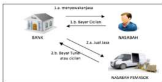
Gambar Skema pembiayaan istishna

8. Bai' al-Istishna' in other words is a way of buying and selling products by ordering (making) products with certain specifications and standards according to the wishes of the buyer. As a sign of commitment and seriousness, customers usually pay a down payment. After the contract or agreement is finalised, the seller produces the ordered goods according to the standards and wishes of the buyer. Although this type of sale and purchase is similar at first glance to the sale and purchase of salam (ba'i salaam), there are still differences between the two. In Istishna sale and purchase, the object being traded does not yet exist and has not yet been produced (Junaidy & Yusriadi, 2022). The delivery of goods will only be made after an agreement is reached between Bai' al-Istishna' example is an order from a manufacturer of goods for the manufacture of chairs, cabinets, and so on. This type of sale and purchase, although the goods being traded do not yet exist, as long as it is based on the principles of mutual agreement ('an taradin'), transparency (not manipulative), trustworthiness, and competence.