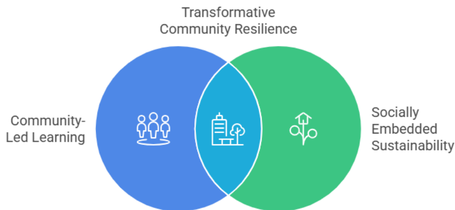
Figure 2 The Synergy of Community-Led Learning and Sustainability

The research emphasized the central role of collaboration in stimulating behavioral change toward sustainable practices. Notably, it was observed that when communities take ownership of educational processes, they exhibit stronger commitment to implementing sustainable solutions. The effectiveness of this model lies in its adaptability to various socio-cultural settings, making it a powerful tool for fostering grassroots participation in sustainable development efforts. Such models, therefore, hold promise for replication in similar developing contexts.