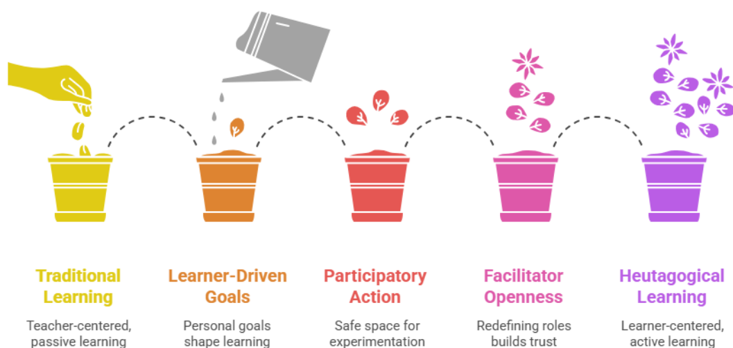
Figure 2 Heutagogy Transformation

learners' lived experiences (Dražić & Devetak, 2025; Hennig et al., 2024). Theoretically, this study contributes to the discourse on inclusive education by presenting heutagogy as a tool to democratize learning. For policymakers and practitioners, the research underscores the potential of participatory and flexible learning designs in enhancing community empowerment and sustainable education outcomes.