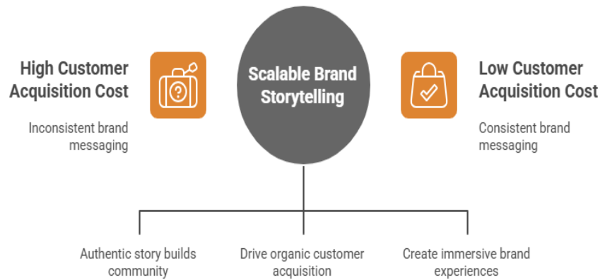
Figure 2. Scalable Brand Storytelling Drives Low CAC

“Case A” (a high-growth venture) provides a narrative illustration of these integrated strategies. The founder, who successfully scaled from one to eight outlets, described the critical inflection point: “I had to stop being the ‘chief barista’ and become the ‘chief storyteller.’ My most important job became creating the 100-page brand book and the 12-week training ‘university.’ I had to trust my team to execute the vision.” This quote is a direct articulation of the “Formalized Creative Systems” and “Decentralized Leadership” themes.