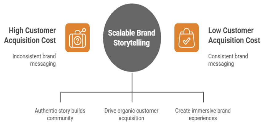
Figure 2. Scalable Brand Storytelling Drives Low CAC

“Case A” (a high-growth venture) provides a narrative illustration of these integrated strategies. The founder, who successfully scaled from one to eight outlets, described the critical inflection point: “I had to stop being the ‘chief barista’ and become the ‘chief storyteller.’ My most important job became creating the 100-page brand book and the 12-week training ‘university.’ I had to trust my team to execute the vision.” This quote is a direct articulation of the “Formalized Creative Systems” and “Decentralized Leadership” themes.