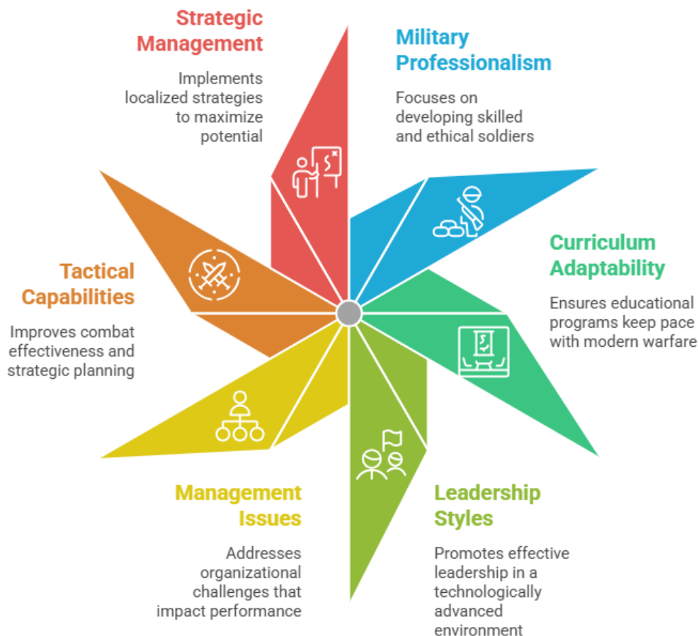
Figure 2. Enhancing Batalyon Arhanud 2 Marinir's Capabilities

Technological literacy emerges as the primary differentiator between a reactive force and a proactive, lethal defensive unit. The shift from analog to digital systems, which is characteristic of modern anti-aircraft warfare, requires a workforce with high cognitive agility and technical comfort. Personnel who are comfortable with automated, computer-based systems are far more capable of managing the fog of war that accompanies modern electronic battlespaces. Consequently, the strategy for developing professionalism must prioritize formal education in software-defined defense systems and data integration, rather than relying solely on traditional marksmanship and physical conditioning.