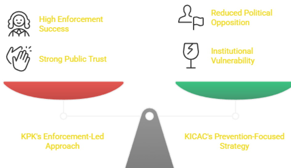
Figure 2. Balancing Enforcement and Vulnerability in ACAs

This study's central finding is the identification of a fundamental trade-off inherent in the institutional design of Anti-Corruption Agencies (ACAs), as vividly illustrated by the divergent trajectories of Indonesia's KPK and South Korea's KICAC. The results demonstrate that the KPK's enforcement-led model, armed with formidable investigative and prosecutorial powers, was highly effective at achieving high-impact enforcement actions and building substantial public legitimacy. However, this very effectiveness engendered continuous, existential political hostility from the elite, locking the institution in a perpetual struggle for survival. Its institutional life has been a paradox of celebrated success and profound precarity (Cai, 2024).