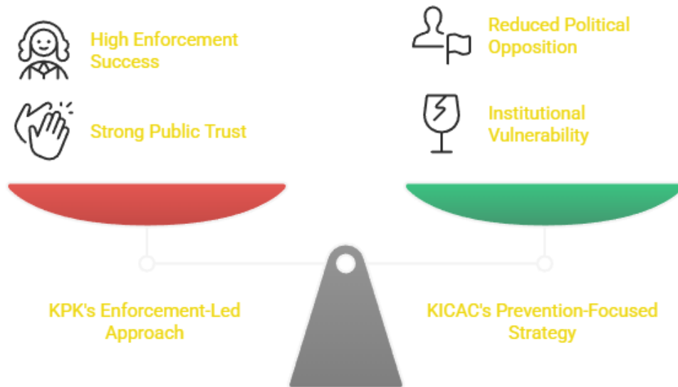
Figure 2. Balancing Enforcement and Vulnerability in ACAs

This study's central finding is the identification of a fundamental trade-off inherent in the institutional design of Anti-Corruption Agencies (ACAs), as vividly illustrated by the divergent trajectories of Indonesia's KPK and South Korea's KICAC. The results demonstrate that the KPK's enforcement-led model, armed with formidable investigative and prosecutorial powers, was highly effective at achieving high-impact enforcement actions and building substantial public legitimacy. However, this very effectiveness engendered continuous, existential political hostility from the elite, locking the institution in a perpetual struggle for survival. Its institutional life has been a paradox of celebrated success and profound precarity (Cai, 2024).