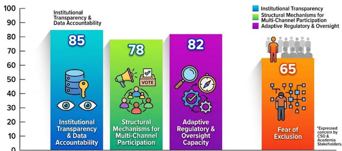
Figure 1. Strate KPK's Core Strategic Design

Three primary, high-order themes were identified as prerequisites for a successful governance framework, shared across all stakeholder groups: (1) Institutional Transparency and Data Accountability, (2) Structural Mechanisms for Multi-Channel Participation, and (3) Adaptive Regulatory and Oversight Capacity. A significant cross-cutting sub-theme was the “Fear of Exclusion,” where stakeholders from CSOs and academia, in particular, expressed strong concerns that the project’s velocity would marginalize non-digital populations and critical voices.