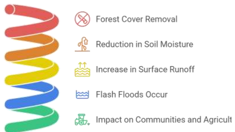
Figure 1. Impact of Deforestation on Water Cycle

A case study conducted in a deforested tropical forest in Southeast Asia revealed dramatic changes in the local water cycle. Prior to deforestation, the forest exhibited high levels of water retention, with soil moisture levels remaining stable even during the dry season. After the forest cover was removed, the area experienced significant changes in the water cycle, including a 40% reduction in soil moisture and a 30% increase in surface runoff during the rainy season. This increase in runoff led to flash floods downstream, affecting local communities and agriculture.