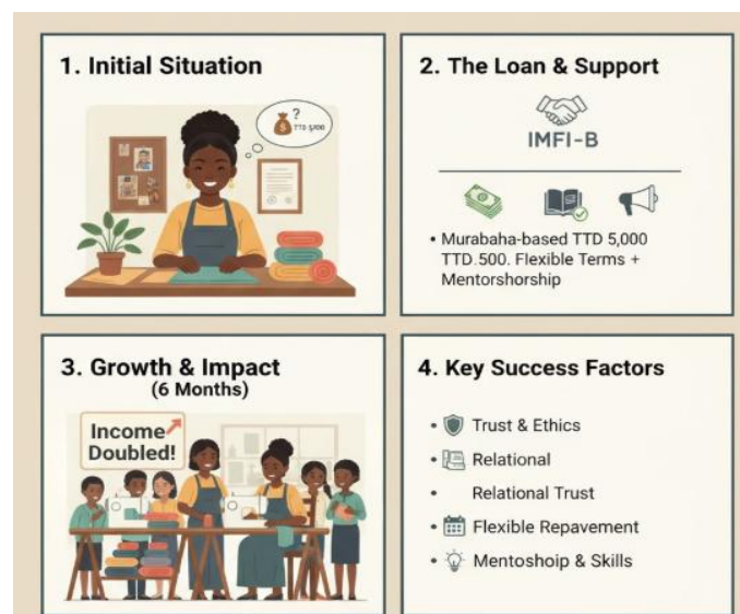
Figure 2. Success Story: Murabaha-Based Business Expansion

A particularly illustrative case involved a female tailor who used a murabaha-based loan of TTD 5,000 to expand her home-based business. Within six months, she doubled her income and began employing a part-time assistant from her community. She attributed her success to the flexibility of the loan terms and the institution's mentorship, which included basic bookkeeping training and marketing support.