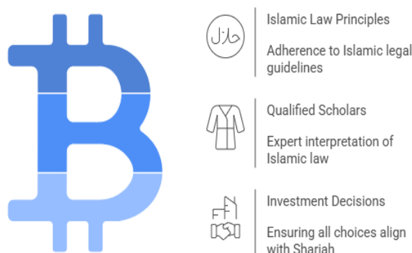
Figure 2. Amana Growth Fund's Shariah Compliance

A case study of the Amana Growth Fund, one of the oldest and most prominent Shariah-compliant mutual funds in the U.S., provided practical insight into successful navigation of the regulatory-religious interface. The fund employs a full-time Shariah supervisory board, uses sectoral and financial screens consistent with Islamic law, and publishes an annual purification report. SEC compliance is maintained through standard mutual fund filings with supplementary disclosures clarifying the religious investment mandate.