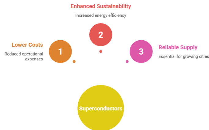
Figure 1. Superconductors Improve Energy Distribution

The implications of these findings are substantial for energy policymakers and industry stakeholders. Implementing superconducting technology could lead to reduced operational costs and enhanced sustainability in electricity distribution. As cities expand and energy demands increase, transitioning to superconductors may be essential for maintaining reliable power supply without extensive infrastructure upgrades (Baig 2023). This research advocates for the prioritization of superconducting technology in future energy planning and investment strategies.